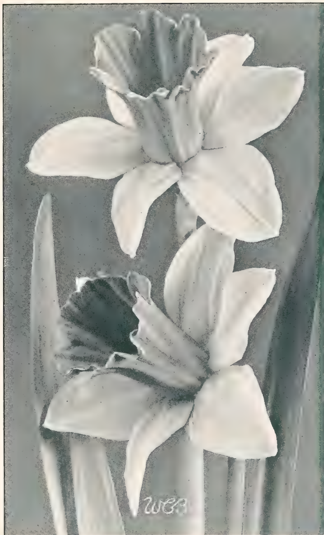
Giant Trumpet Daffodil